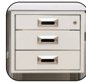
Three Drawer Box