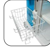
6" Storage Basket