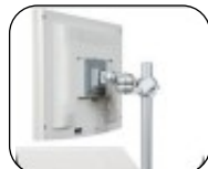
15" Extended Mount