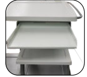
Front Sliding Keyboard Tray