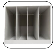
Vertical Storage Slots