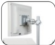
Standard 8" Flat Panel Mount