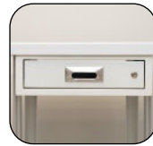
Single Drawer Box