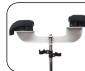
Dual Scope Hanger