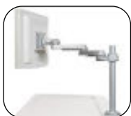
25" Articulating Mount