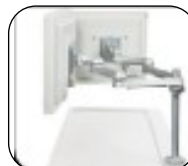
25" Dual Articulating Mount