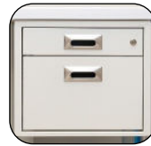
Two Drawer Box