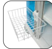
3.5" Storage Basket