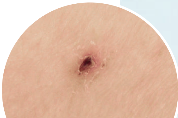
After 10 days