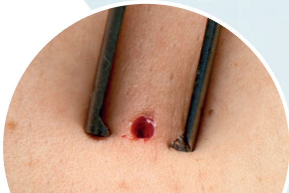
Postoperative, after removal of the trocar