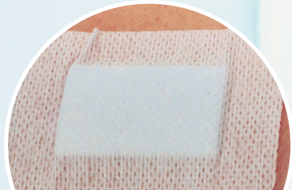
Postoperative wound care